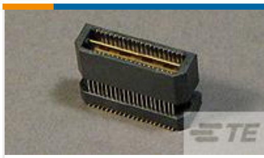
TE Part # 7-1658439-1 MSB0.80PL14ASY28DP,GP,30,VCTR