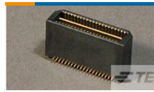
TE Part # 7-1658465-1 MSB0.80PL11ASY28DP,GP,30,VCTR