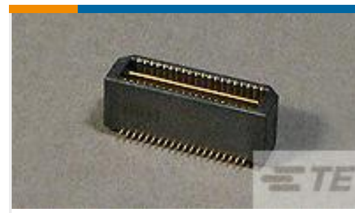
TE Part # 7-1658464-1 MSB0.80PL8ASY28DP,GP,30,VCTR