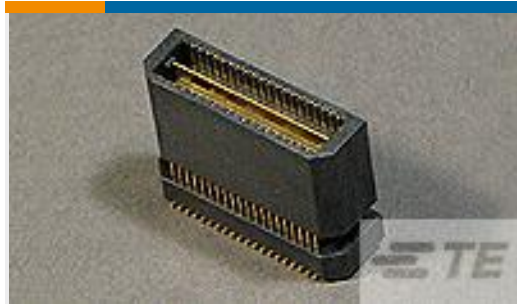
TE Part # 7-1658466-1 MSB0.80PL16ASY28DP,GP,30,VCTR