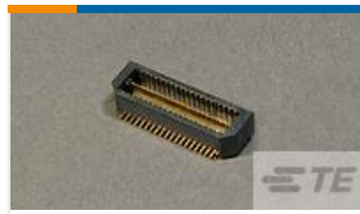
TE Part # 7-1658463-1 MSB0.80PL5ASY28DP,GP,30,VCTR